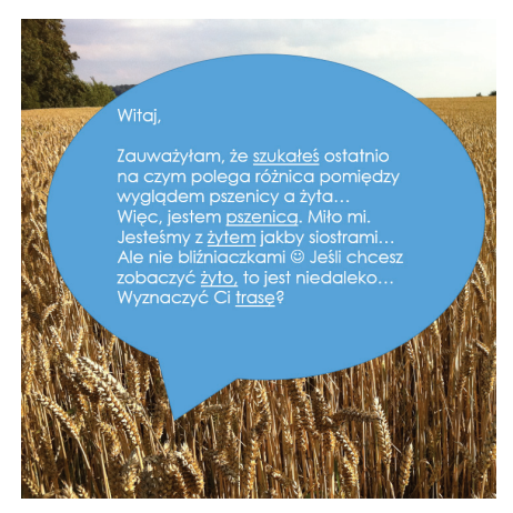
Figure 2. Interaction of a natural object with a human being

It is important to emphasise that each time it is not a physical object that leads a "conversation," only the previously mentioned object avatar in the application layer of the postulated knowledge transfer environment, containing artificial intelligence that associates behavioural patterns and context and initiates interaction based on the evaluation of existing relationships. Figure 2 illustrates an example of human interaction with an object that is part of nature, namely, of a wheat field: