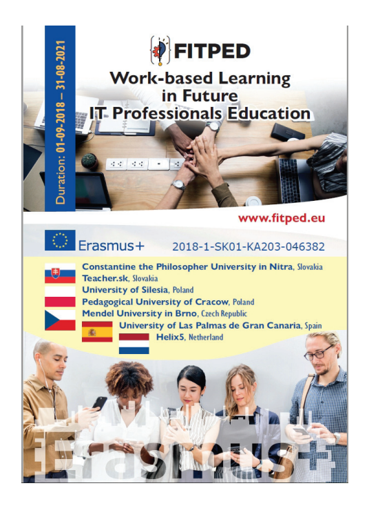
Photo 10, 11. FITPED Project poster and Programme of Multiplier event on 15th October 2019.