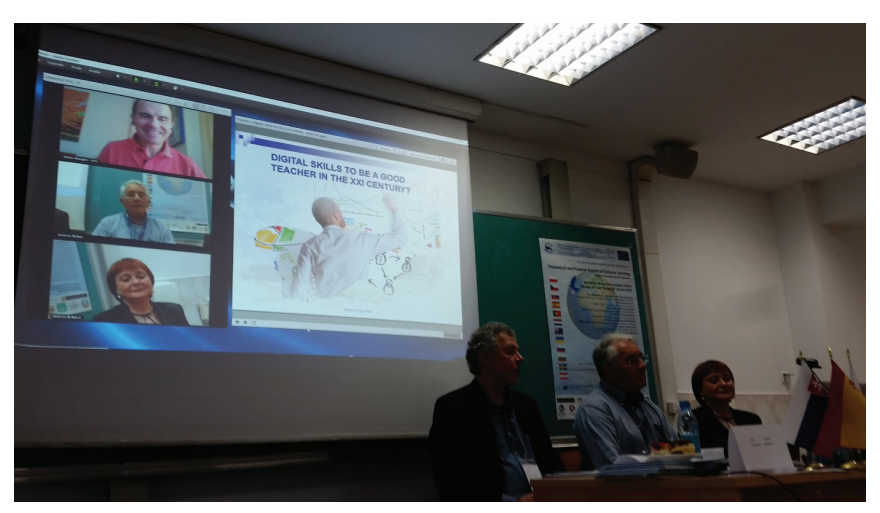
Photo 5. Participants of the E-round table debate on "The Digital Revolution" (moderated by Antonio dos Reis), which was held at 11.00 a.m. Experts from different countries: Theo Hug (Austria), Nataliia Morze (Ukraine), Xabier Basogain (Spain), Olga Yakovleva (Russia) participated in person and in remote mode.