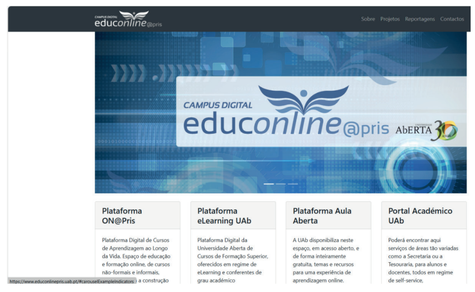
Figure 5. Website of a Virtual Campus for the inmate population