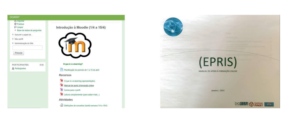
Figure 2. Website of the Moodle platform: How to become an Online Student

The second phase is similar to the first phase of the project, however, the content is complemented with the questions referring to entrepreneurship and parental skills. It is the Training Continuity Phase: it includes modules from the first phase extended by: