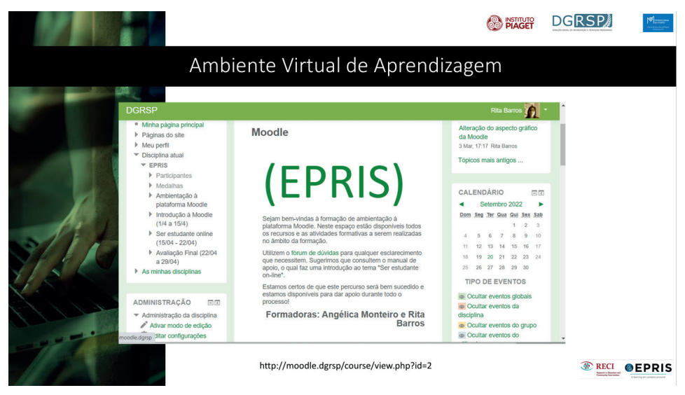
Figure 1. Website of platform of EPRIS@ Project

The project platform looks as follows (Figure 1).