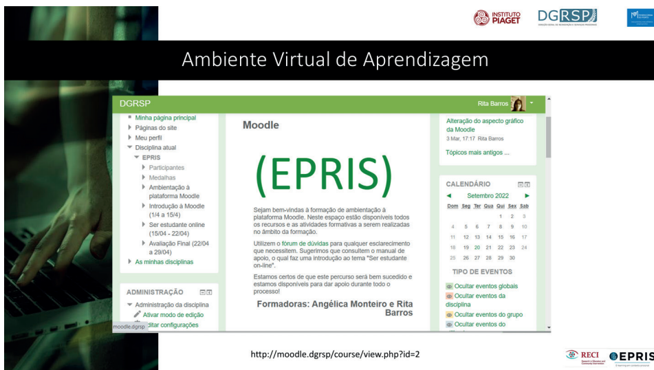
Figure 1. Website of platform of EPRIS@ Project

The project platform looks as follows (Figure 1).