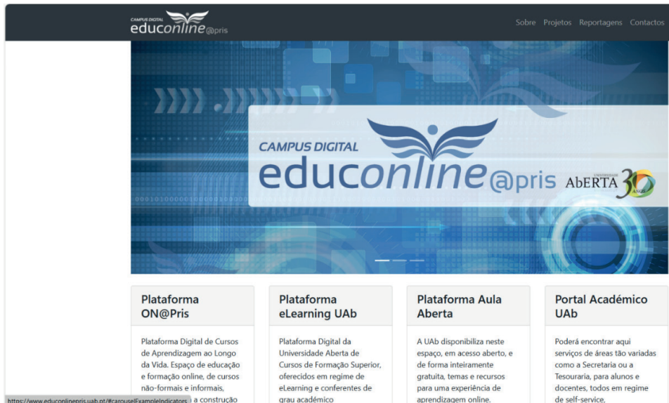
Figure 5. Website of a Virtual Campus for the inmate population