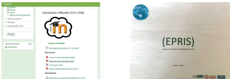
Figure 2. Website of the Moodle platform: How to become an Online Student