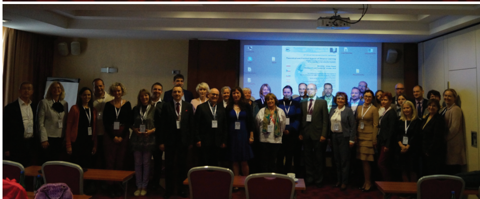
Figures 6, 7. Participants of the DLCC2018 conference and the EU IRNet project.