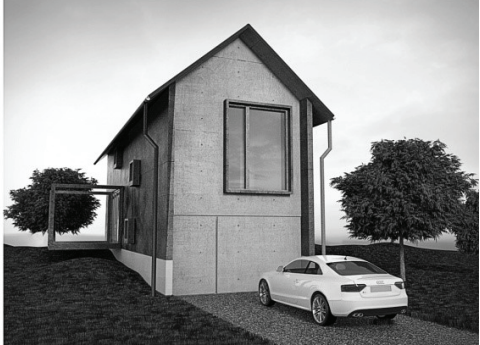
Figure 1. Left: basic rendering with Sunlight and Sky illumination only (Barbara Gwóźdź). Right: advanced rendering in V-Ray with HDRI Sky (Piotr Grabowski).