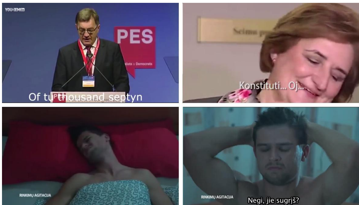
Picture 5. Screenshots from Homeland Union – Lithuanian Christian Democrats video advertisement