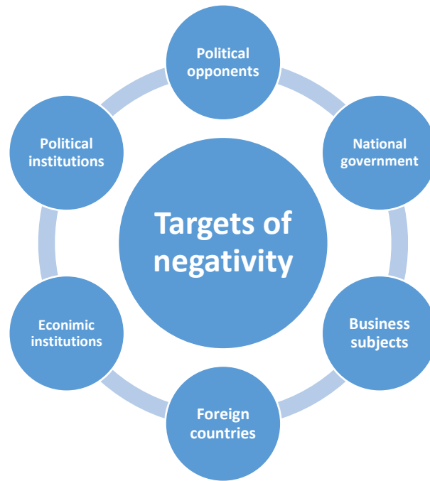
Picture 2. Targets of negativity