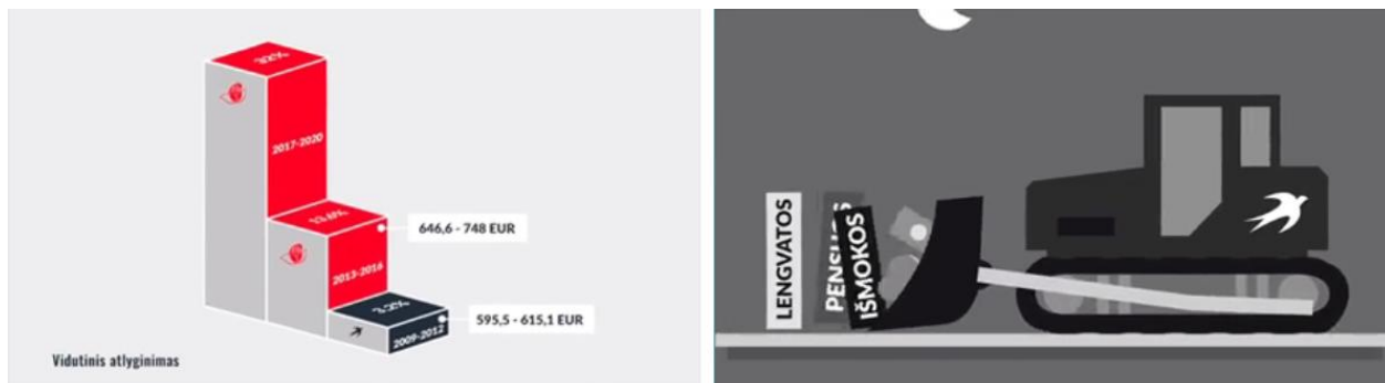
Picture 3. Screenshots from Lithuanian Social Democratic Party video advertisements