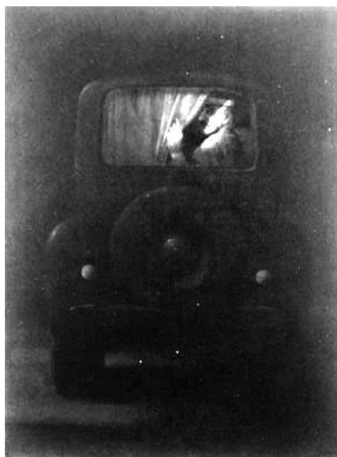
Figure 3. Komar and Melamid, I Saw Stalin Once When I Was a Child . From Nostalgic Socialist Realism series, 1981-82.

The Muse is tracing the outline of Stalin's shadow on the wall, the act that, according to the classical mythology, was the origin of painting; the girlfriend traces the outline of the shadow of her boyfriend. Stalin in this case is represented as a mythological figure. Another picture is a representation of Stalin as an everyday person. You see Stalin as a person sitting in front of a mirror without his boots, and you can see him in his everyday life and maybe in a critical moment of his conscience. The third example is painting "I Saw Stalin Once, When I Was a Child." This painting is from the collection of the Museum of Modern Art in New York.