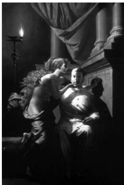
Figure 2. Komar and Melamid, The Origin of Socialist Realism . From Nostalgic Socialist Realism series, 1982-83, Zimmerly Museum, NJ.

Later in 1980s, we created a kind of museum sots art, in style of dark classic paintings. It is also the result of mixture of the pop mass culture criterion and the elite culture criterion. Most of these canvases represent the leaders, Lenin and Stalin. There were two ways to represent these leaders. One was to represent them as mythological figures, for example, as you see in the painting “The Origin of Socialist Realism.”