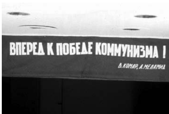
Figure 1. Komar and Melamid, Onward to the Victory of Communism! From Sots Art series, 1972. 1

We were surrounded by such slogans. But when we signed them “Komar and Melamid” (and actually nobody remembered who said it first), it produced a shocking effect which I can compare to Marcel Duchamp signing the “pissoir.” They were very typical prototypes of pop art and sots art.