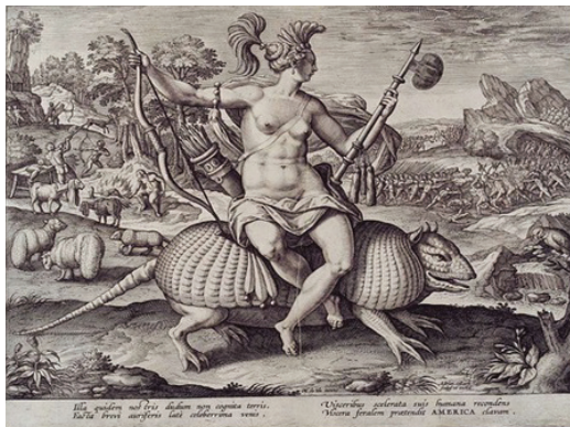
Fig. 1. America . 1551–1600. Marten de Vos (drawing) and Adriaen Collaert (engraving).

The iconography allegorically representing America as a savage, nude woman is abundantly known by all of us. I go back to these images to remind you of painters such as Marten de Vos (Fig. 1 and 2), Jan van der Straet (Fig. 3) and Philippe (or Philips) Galle (Fig. 4), on one side representing Europe as a woman richly dressed, while on the other America is represented by a lack–of vests, ornaments and emblems of wisdom and power beyond the scenery where she is placed.