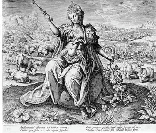
Fig. 2. Europa. 1551-1600. Marten de Vos (drawing) and Adriaen Collaert (engraving).