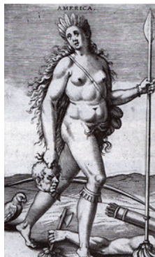
Fig. 4. Allegory of America, 1547-1612. Philippe Galle (engraving).