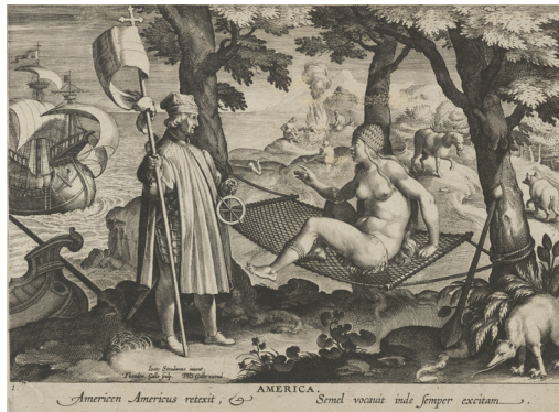
Fig.3. America. 1575-1580. Jan van der Straet (drawing).