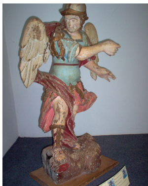
Fig. 5. Mission Art, image of Saint Michael Archangel, 17 th century.

The sculpture speaks for itself: between 1710 and 1735, The Seven Peoples of the Missions situated at the South of South America, in territories occupied today by Brazil, Uruguay, Argentina and Paraguay, lived their manifest apogee through architecture, music and sculpture. The Jesuits offered the Indians models from the European baroque, slowly subverted by the autochthones who introduced elements from their own reality and created the first copies of composite and transcultural art. In this image of Saint Michael the Archangel (Fig. 5), one notices the substitution of the dragon—