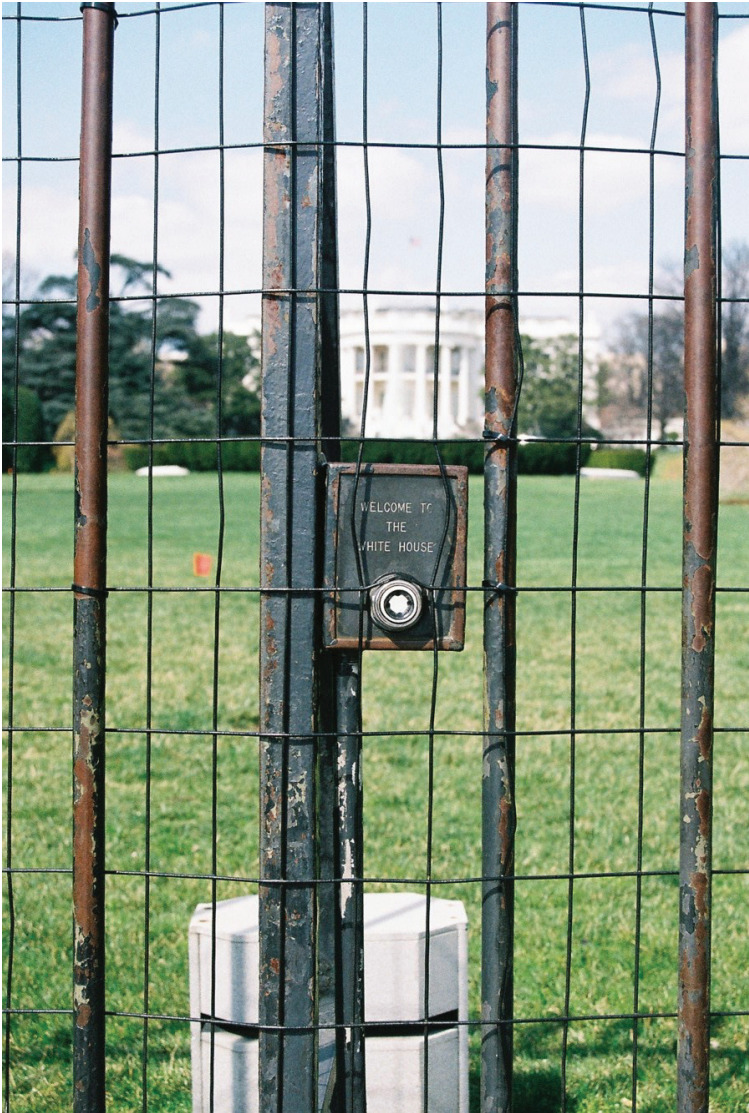
Fenced White House Welcomes Latino Immigrants (2006–2016) La Casa Blanca Encerrada da Bienvenida a Inmigrantes Latinos (2006–2016) (from Series: "Cruces: Crosses and Crossings"), 2008