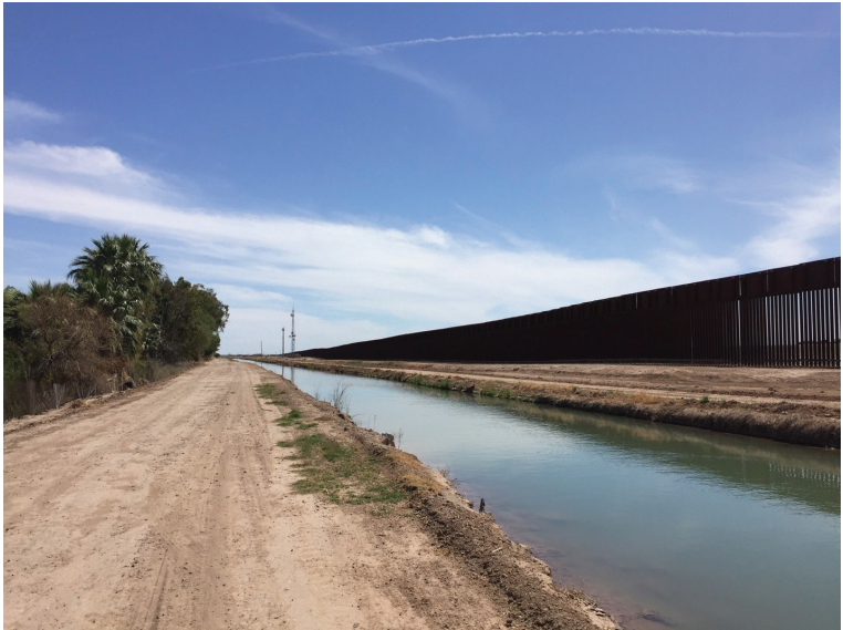
Border wall between Gadsden, Arizona, and Baja California State, 2016

Walls, Material and Rhetorical: Past, Present, and Future