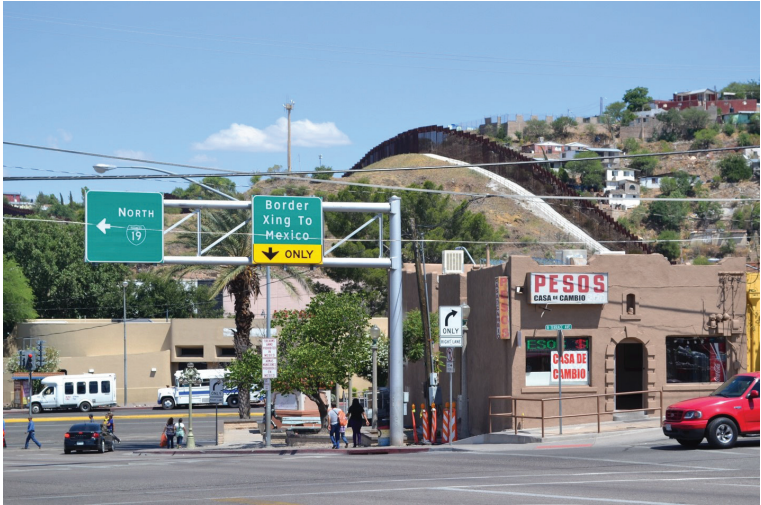
Border wall view from major street in Nogales, Arizona, 2017