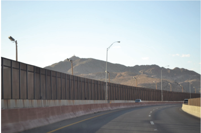
Border Wall at Paso del Norte Muralla Fronteriza en Paso del Norte (from Series: "Cruces: Crosses and Crossings"), 2016