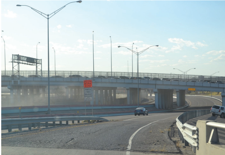
Border Patrol Waiting Patrulla Fronteriza Esperando (from Series: "De Espaldas/Seen from the Back"), 2016