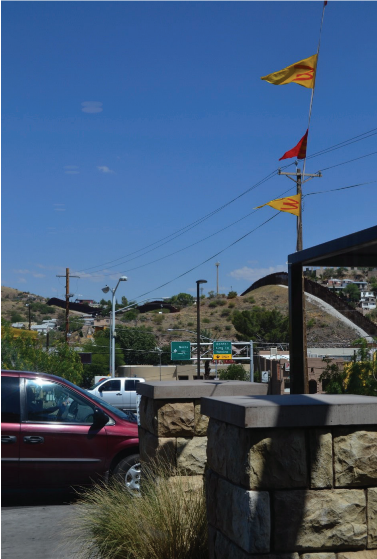
Border wall between Nogales, Arizona and Nogales, Sonora (view from McDonalds), 2017