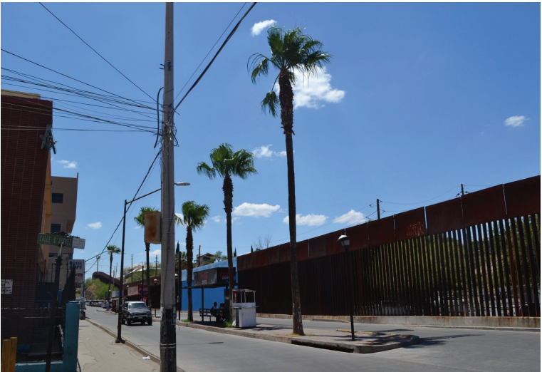
Border wall view from the Mexican side in Nogales, Sonora, 2017

Walls, Material and Rhetorical: Past, Present, and Future