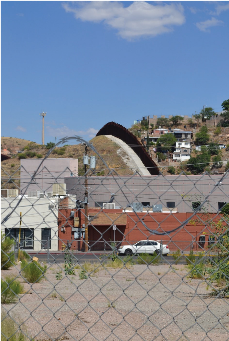
Border wall view from parking lot in Nogales, Arizona, 2017