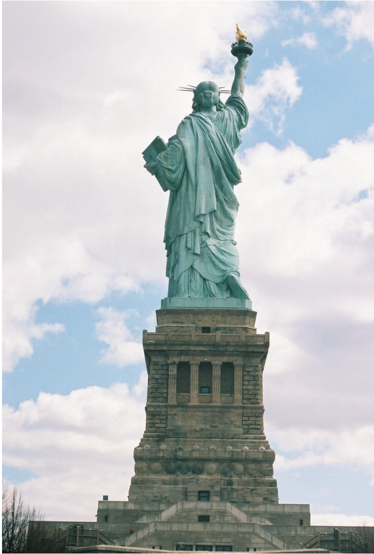
Statue of Liberty Turns Its Back on Mexican Immigrants La Estatua de la Libertad le da la Espalda a Inmigrantes Mexicanos (from Series: "De Espaldas/Seen From the Back"), 2008