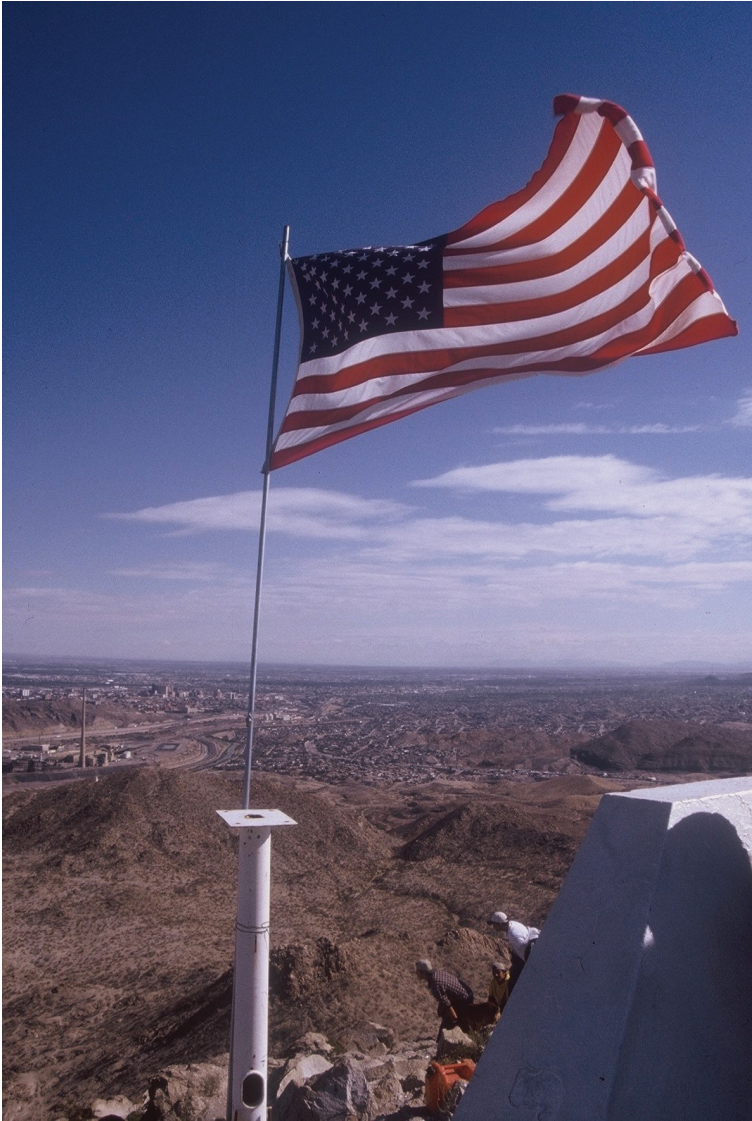
In Search of the American Dream / Buscando del Sueño Americano (from Series: "Cruces: Crosses and Crossings"), 2004