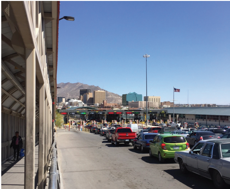
Crossing the Bridge: Welcome to the United States Cruzando el Puente: Bienvenidos a los Estados Unidos (from Series: "Cruces: Crosses and Crossings"), 2016

Alejandro Lugo Arizona State University USA