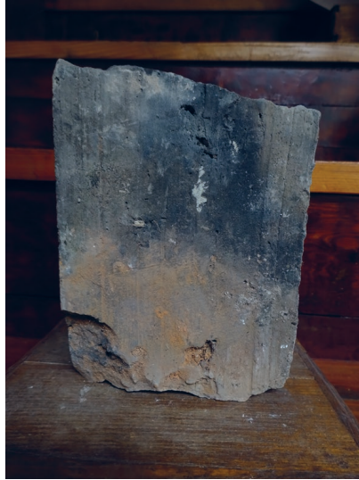
Photos 7 and 8. Two brick landscape with added effects created by demolition process – remaining layer of another brick and glowing orange hue from a red brick.

personal realm of ink and imagination, and now seem able to become a permanent element of any contemporary study room. In the most admirable way they revealed a slightly subversive dimension as well – smuggling into the extinction of a built and lived world, annihilated by the demolitions, a component of both time and space-transcendent Chinese tradition.