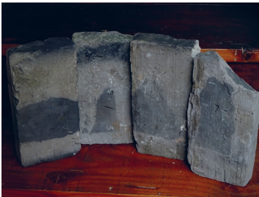
Photo 6. Four bricks reveal to an attentive viewer views of four mountains, which may bring to mind famous Guilin scenery.

However, certain essential differences between dreamstones and inky bricks can be noticed as well. Bricks have a very different relation with time, as well as a very different appeal from rock and