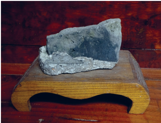
Photo 5. Brick displayed on a wooden stand.

a demolition. Both require a unique combination of certain visual competence and luck, both equally indispensable to succeed. The accidental process which leads to emergence of “ink landscapes” in both cases does not involve any intent whatsoever for these landscapes to be viewed by anyone, and yet the landscape is revealed. In case of the dreamstones, seasoned professionals, known as revealers, study the outside skin of the marble slabs and decide how to cut off the stone to obtain a piece of perfect beauty. In case of the bricks, construction workers destroyed the walls and then I acted as a “revealer” of a kind, walking carefully through the site and taking time to “discover a landscape” – decide whether it is indeed there, repeatedly seen in a certain discarded brick. Ideally, dreamstones should not be enhanced or alternated, only cut and polished – therefore, I did not manipulate the landscapes in the bricks either. I only decided which side(s) of the bricks disclosed a landscape to me, and which perspective was most interesting for a display (Photo 5 and Photo 6).