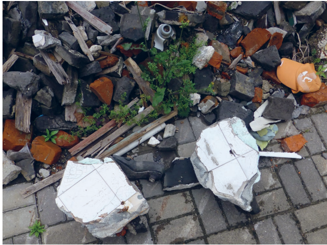
Photos 1 and 2. Discarded old bricks in a demolition site along Xinzha Road.